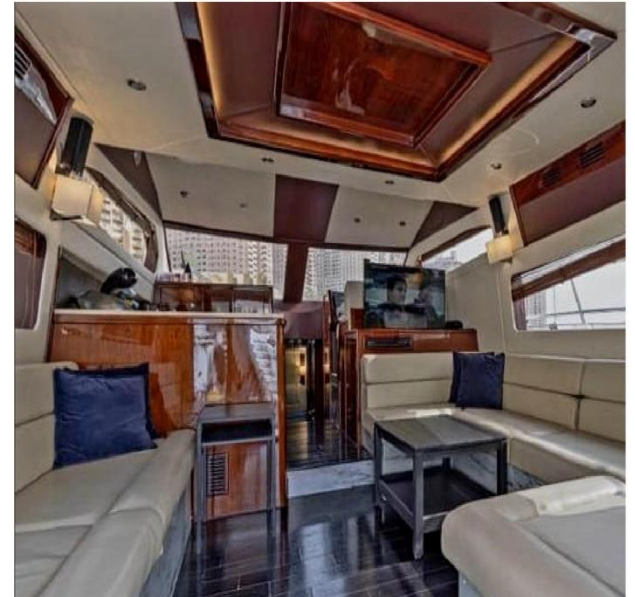
AS 50 Luxury Yacht | ASMarine 08