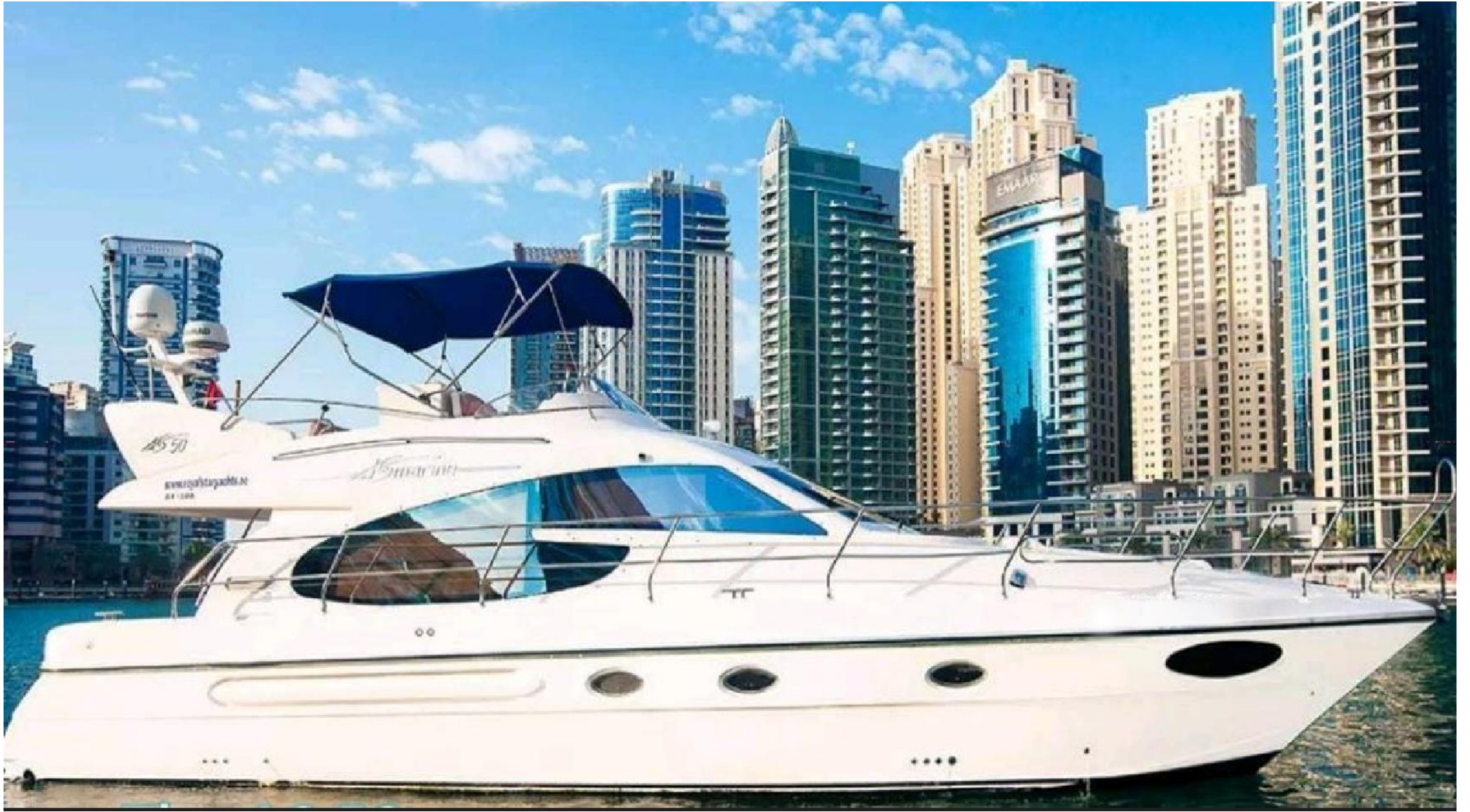
AS 50 Luxury Yacht | ASMarine 05